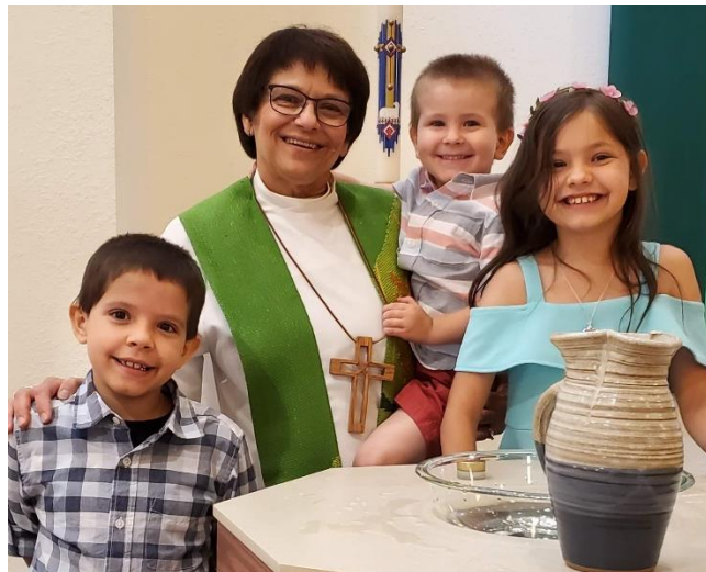
Just one example of a shared “God Moment” – baptizing these three children of God on July 21.

That’s the very BEST thing about being your pastor ... seeing God at work in and through you and getting to be a part of it. I know you will keep it up!